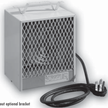
shown without optional bracket