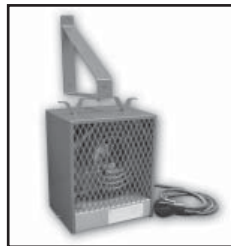
shown with optional bracket

This high power portable economy heater is designed to provide a back-up heating source at a truly affordable price.