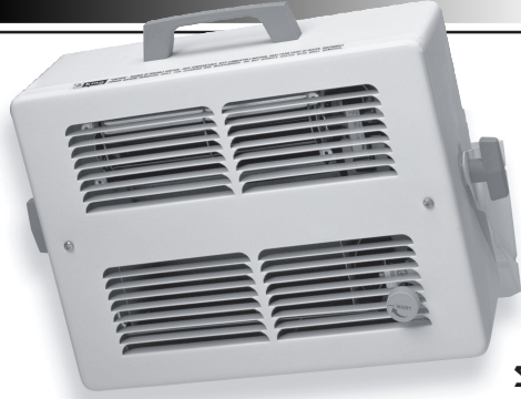
SMART LIMIT PROTECTION™

The PWH works great as a small shop heater as the swivel bracket will wall or ceiling mount. Then the heater can be rotated to direct the warm air right where you need it. It comes with a built-in thermostat and a 6ft, 3-wire plug. The quiet operation allows you to place this heater in and all applications that need heating.